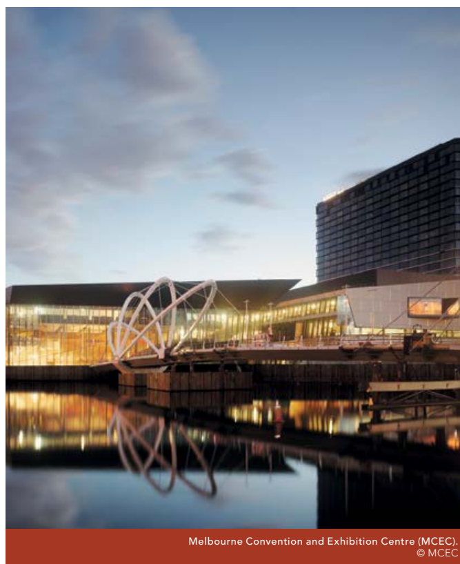
Melbourne Convention and Exhibition Centre (MCEC).

For more information about Melbourne please visit http://www.aids2014.org/welcome_to_melbourne.aspx