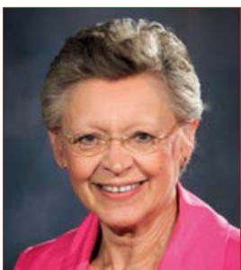
FRANÇOISE BARRÉ-SINOUSSE, PHD

We look forward to a strong global partnership among science, leadership and community in building a conference programme that will take another step towards ending the AIDS epidemic.