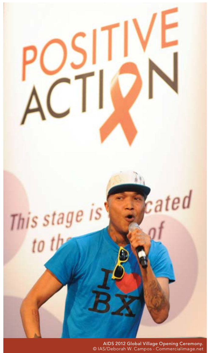
AIDS 2012 Global Village Opening Ceremony.

To download the Programme Activities Submission Guidelines, visit: http://www.aids2014.org/Default.aspx?pageId=621