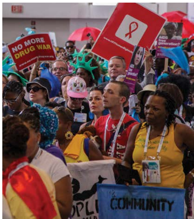
Pacific demonstration at AIDS 2012.