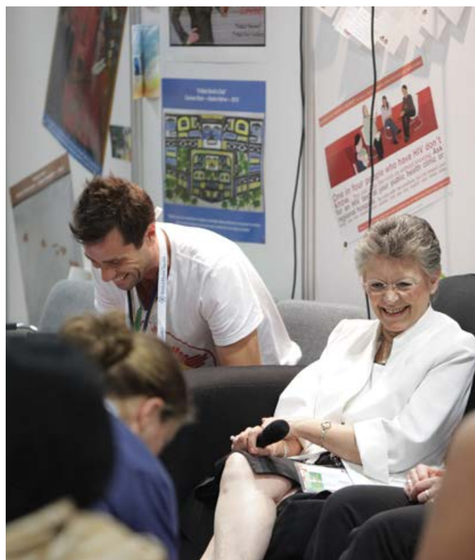
Françoise Barré-Sinoussi, AIDS 2014 International Chair, at the AIDS 2012 Global Village.

For more information on the Melbourne Convention and Exhibition Centre (MCEC), please visit: www.mcec.com.au