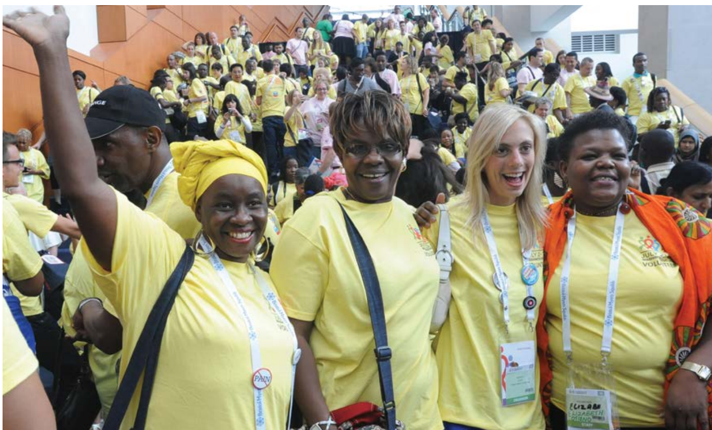
Four of the 991 AIDS 2014 Volunteers.